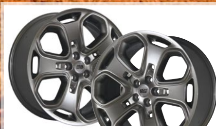
8 alloy rim MSF2 in 20"