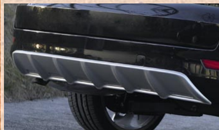
2 rear skidplate