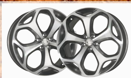
6 alloy rim MSF1 in 20"