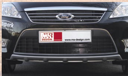
1 front skidplate